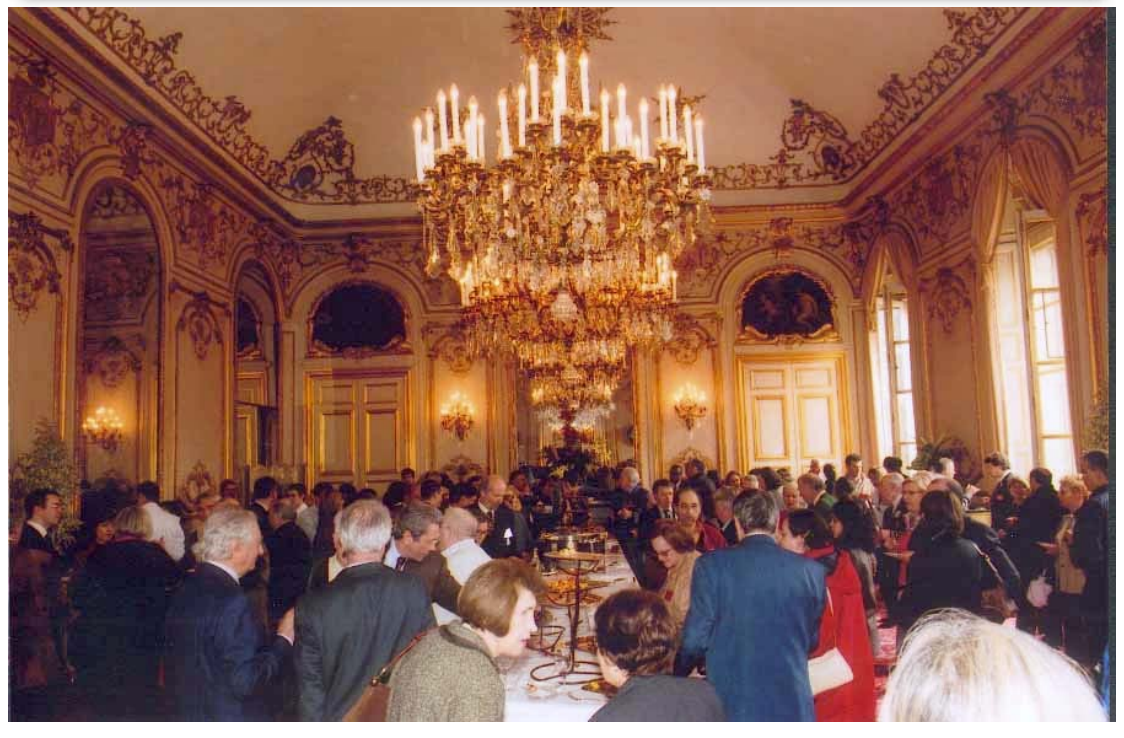
Salons Boffrand de la Présidence du Sénat